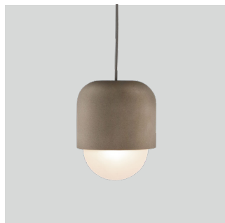
concrete gray + matt opal