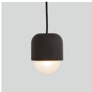
concrete dark grey + matt opal